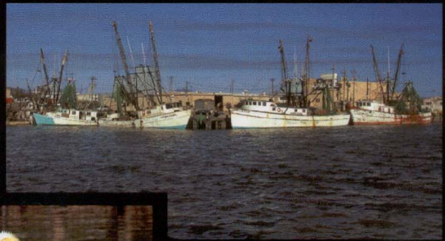
Port Lavaca, Texas