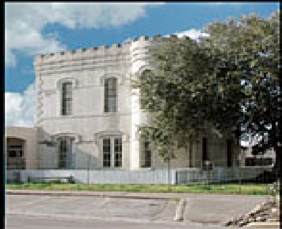
Port Lavaca, Texas Nautical Landings Marina MainStreet Theatre Old Jail House